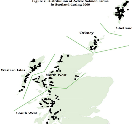
Figure 7. Distribution of Active Salmon Farms in Scotland during 2000