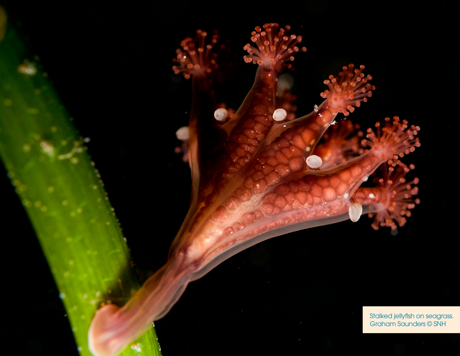
Stalked jellyfish on seagrass.