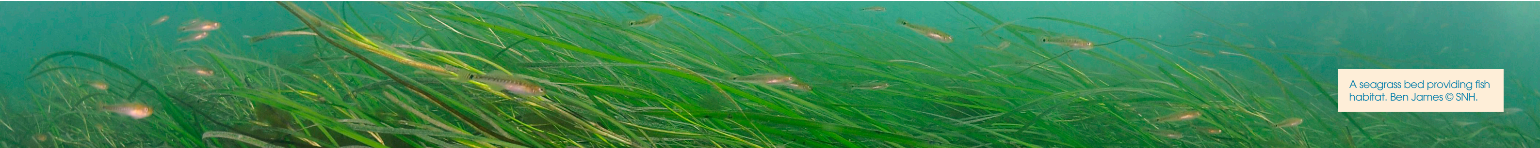
A seagrass bed providing fish habitat.