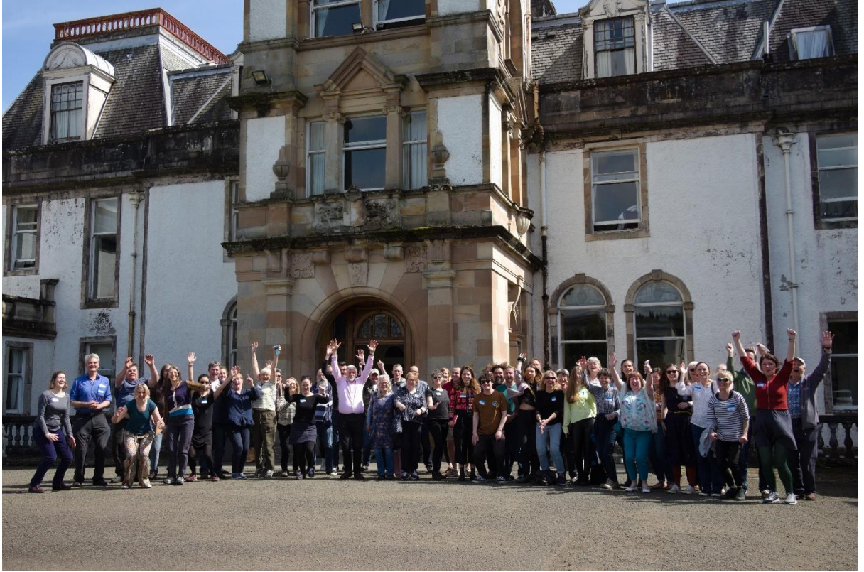
Gartmore delegates