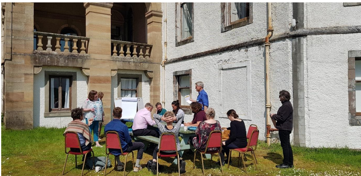
CCN members discussing their future, image: Fauna & Flora