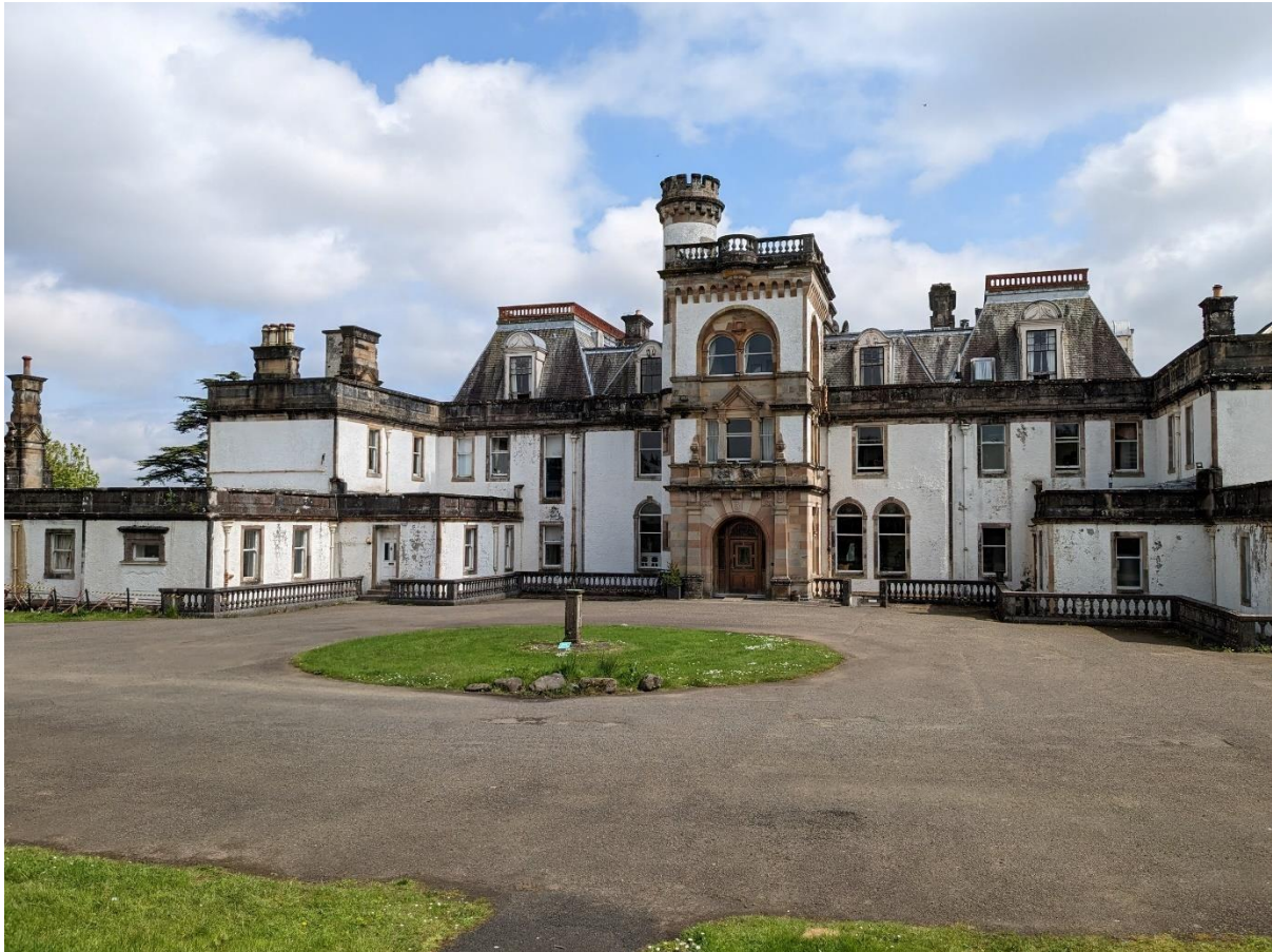
Gartmore House, image: Fauna & Flora